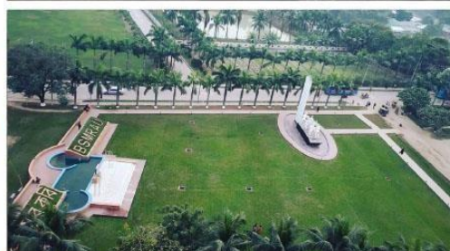
Student dormitories and library building area front