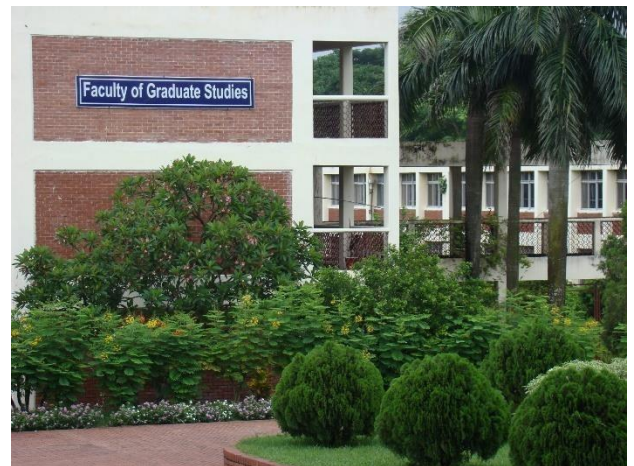
Faculty of Graduate Studies

The University has special schemes to support students coming from low to middle income countries. A range of scholarships and grants are available for financially constrained foreign students to support their study at GAU. We also offer education at subsidized rate for International students.