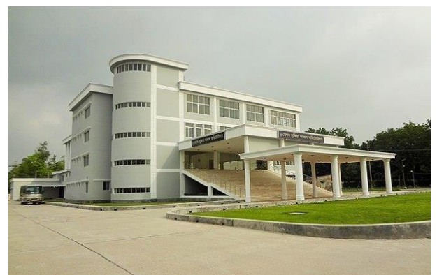
Begum Sufia Kamal Auditorium