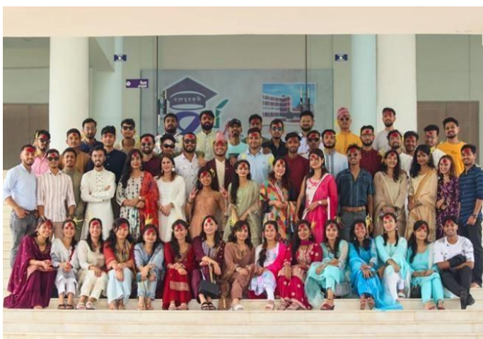
Foreign students celebrating their tradition