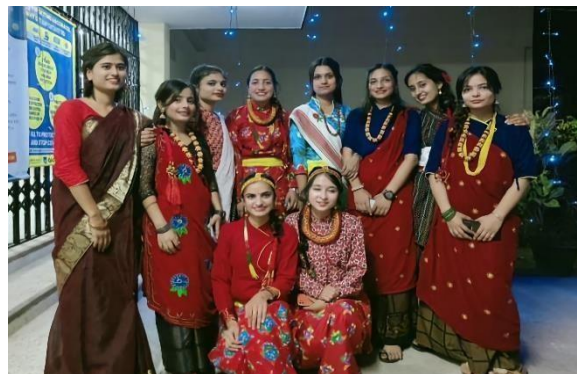
Foreign students attending cultural events