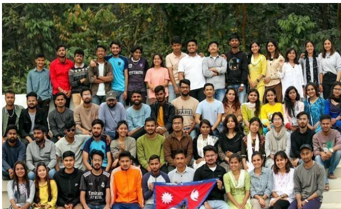
Foreign students at GAU

Welcome to Gazipur Agricultural University (GAU) where we connect with the world to advance knowledge, share international experiences in academia and research, and create innovative solutions to universal challenges in agricultural education. The Office of International Affairs shall endeavor to promote and raise the profile of the University as a top-tier research and educational institution through its strong national and international alliances and partnerships.