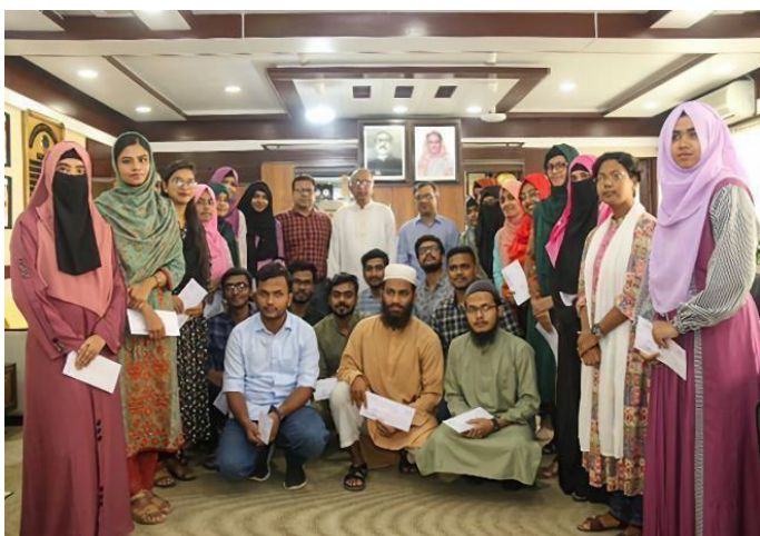
NEF (Japan) Scholarship Ceremony-2024