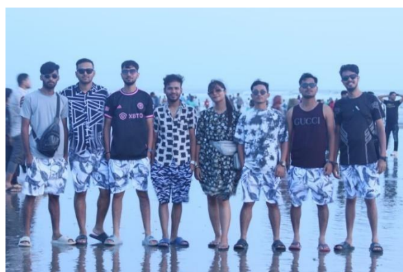
Foreign students in a study tour