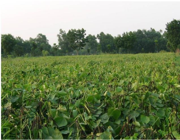
BU mug 4