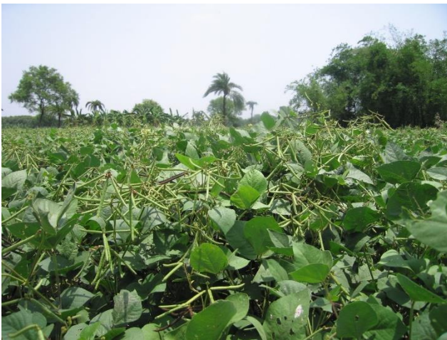
BU mug 2