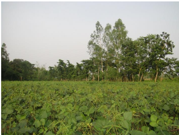
BU mug 5