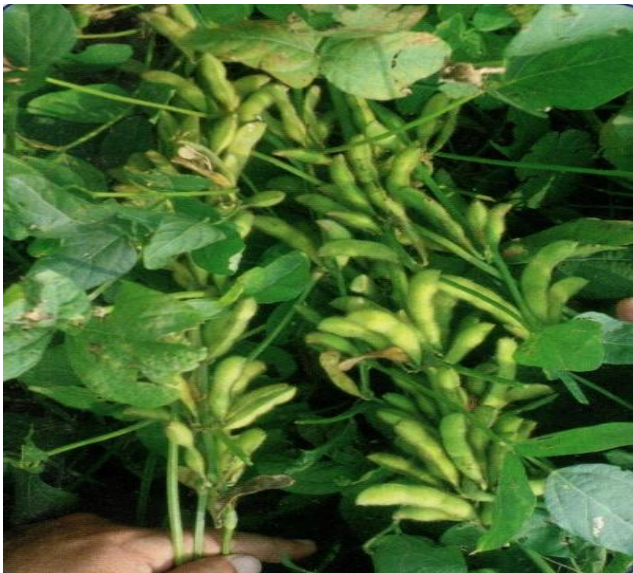
BU soybean 1)