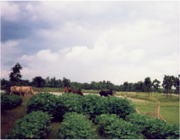
BU mug 3