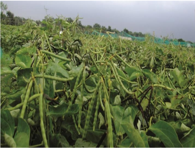
BU mug 6