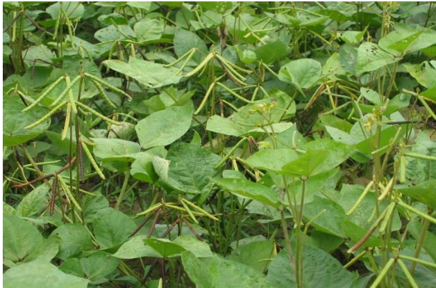
BU mug 1