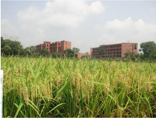
BU dhan 1