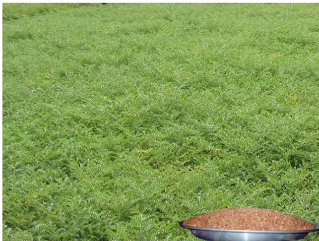
BU chola 1)